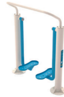
Air Walker Code: T0010409