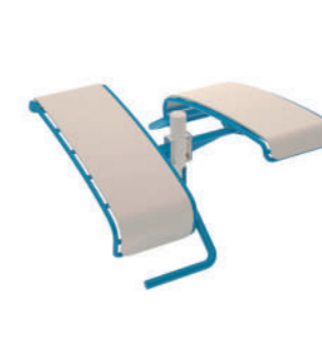
Sit Up Bench Code: T0010423