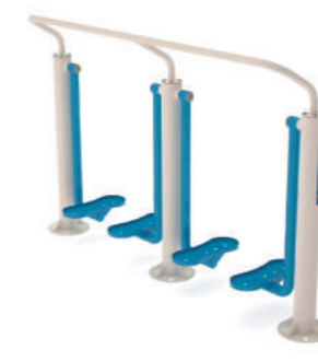
Double Air Walker Code: T0010489