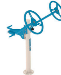
Thai Chi Spinners with Hand Bike Inclusive Code: T0010499