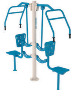
Chest Press Code: T0010496