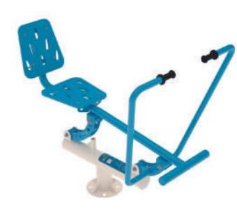
Rower Machine Code: T0010417