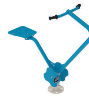
Bike Fitness Code: T0010491