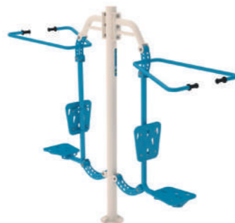
Lat Machine Code: T0010471