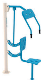
Single Chest Press Code: T0010500