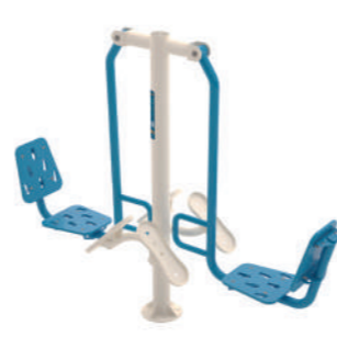
Leg Press Code: T0010404