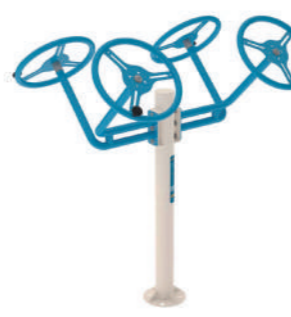
Thai Chi Spinners Code: T0010487