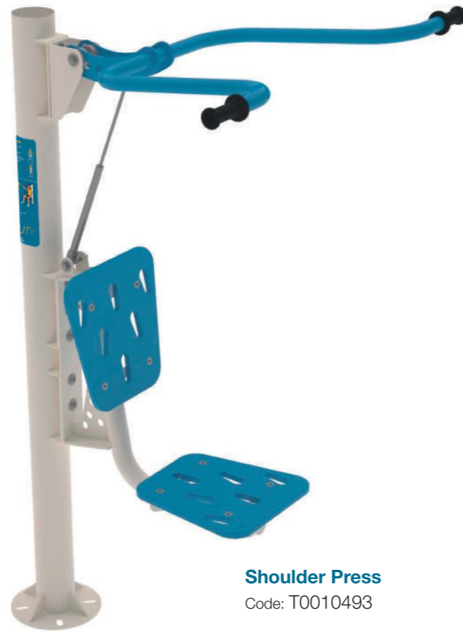
Shoulder Press Code: T0010493

Ogni attrezzo del percorso Vitality ha una scheda con le indicazioni per compiere l'esercizio nel modo corretto.