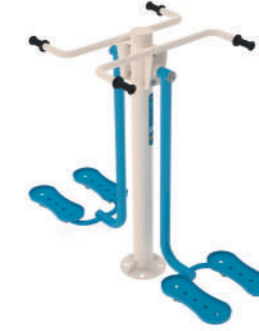
Surfboard Station Code: T0010415