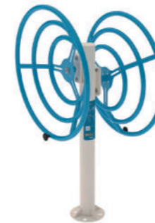
Shoulder Builder Code: T0010488