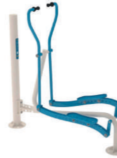
Ellittica / Cross Trainer Code: T0010425