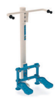
Step Code: T0010497