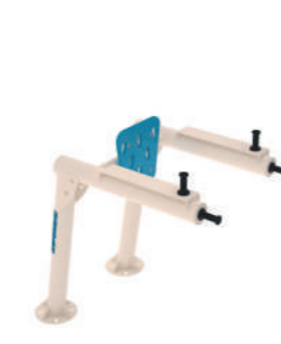
Body Weight Code: T0010495