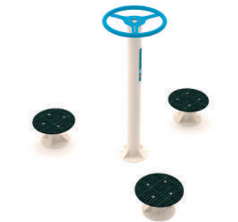
Twister Station Code: T0010402