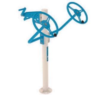
Thai Chi Spinners with Hand Bike Code: T0010494